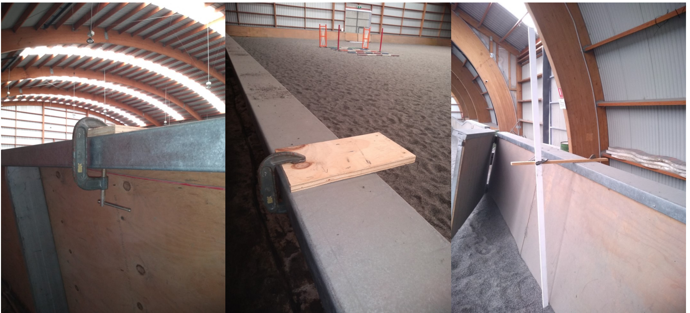
Outside arena showing clamp

In either case, you will need something to stop items falling outside the barrier as it will be a long walk to go get the item.